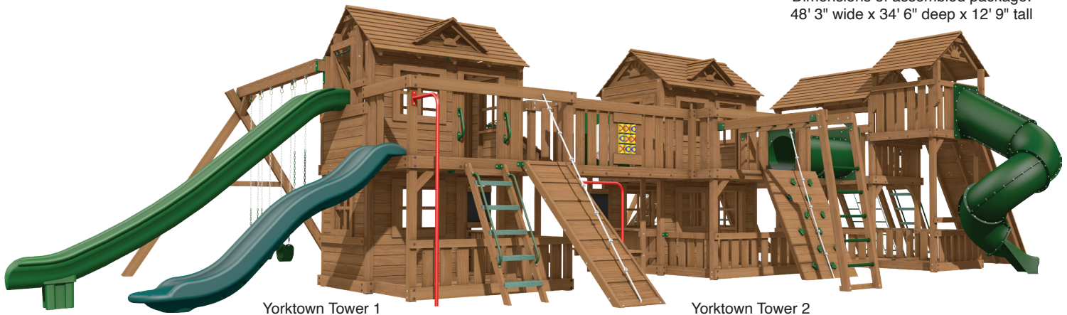
Yorktown Tower 1

Dimensions of assembled package: 48' 3" wide x 34' 6" deep x 12' 9" tall